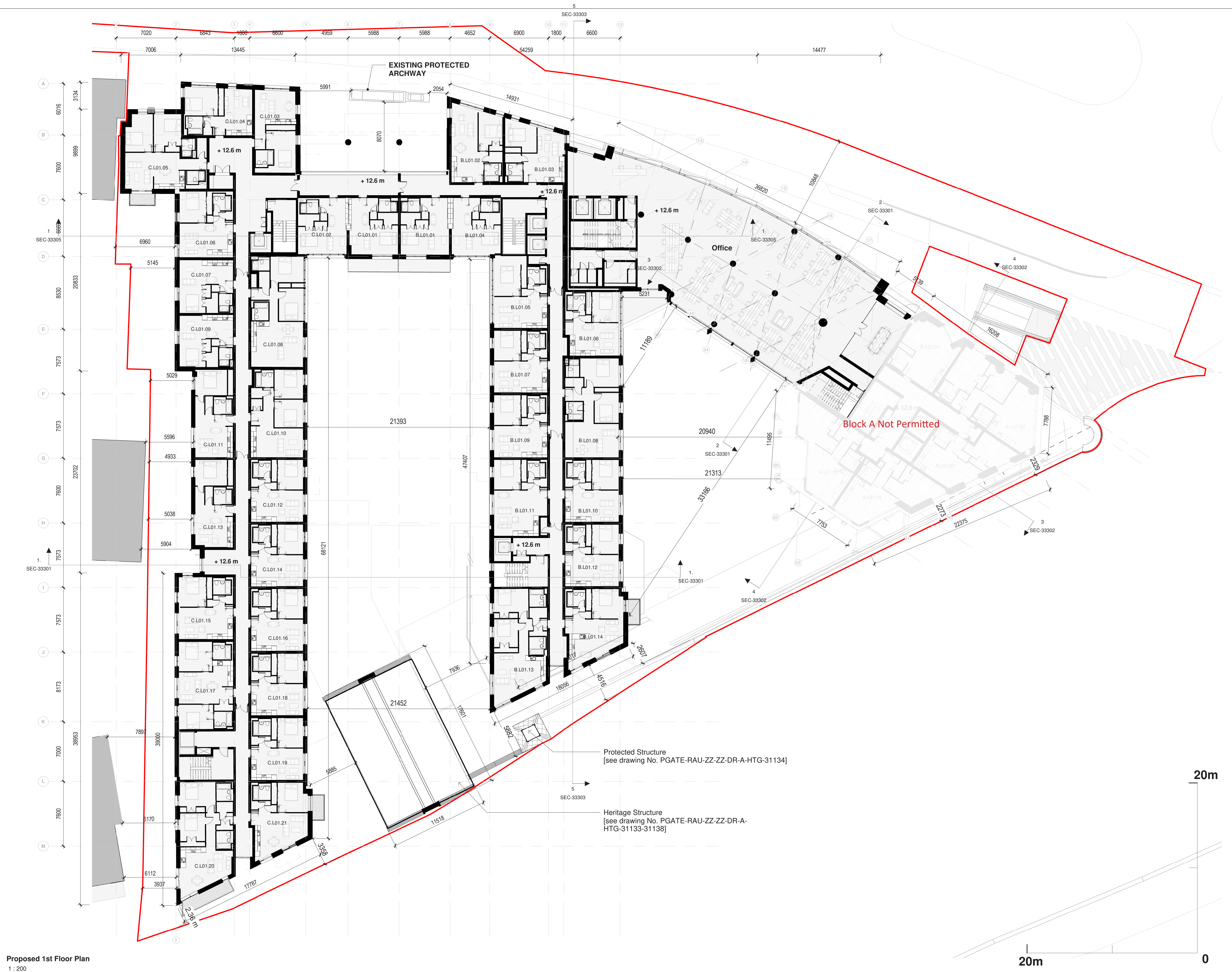
Proposed 1st Floor Plan 1 : 200

Notes: DO NOT SCALE FROM THIS DRAWING. USE FIGURED DIMENSIONS IN ALL CASES. VERIFY DIMENSIONS ON SITE AND REPORT ANY DISCREPANCIES TO THE ARCHITECTS IMMEDIATELY. THIS DRAWING TO BE READ IN CONJUNCTION WITH THE ARCHITECTS SPECIFICATION. © THIS DRAWING IS COPYRIGHT AND MAY ONLY BE REPRODUCED WITH THE ARCHITECTS PERMISSION.